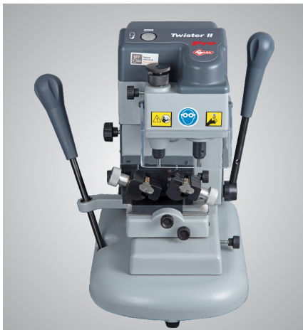
Twister II Pro

Twister II Pro is a mechanical key cutting machine for Dimple keys with Flat and Angled cuts, Side Wall Dimples, Laser keys with internal, external and double external cuts. Tibbe keys*, Flat / Edge keys* and Mercedes keys* can also be duplicated using the optional adaptors & accessories.