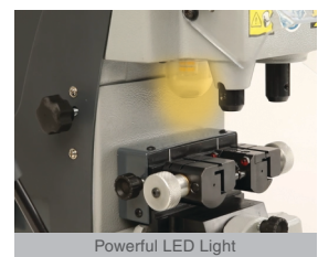
Powerful LED Light

A specific range of optional accessories is available to expand the machine capabilities.